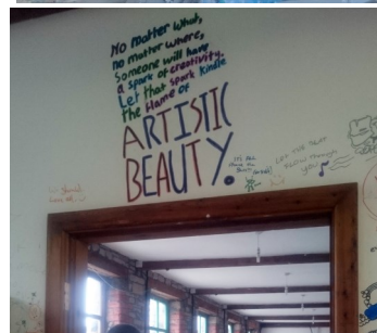
Left top - a message on the wall