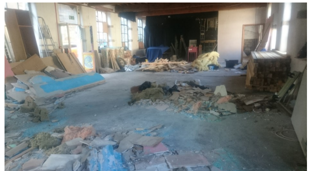
Above - the old room being dismantled

Overall it has allowed us to save on our overheads which hopefully means we'll survive into the future and continue to provide creative activities for young people for a long time to come.