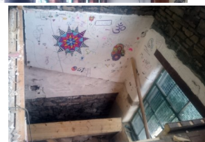
Left bottom - the stairs used to be here!